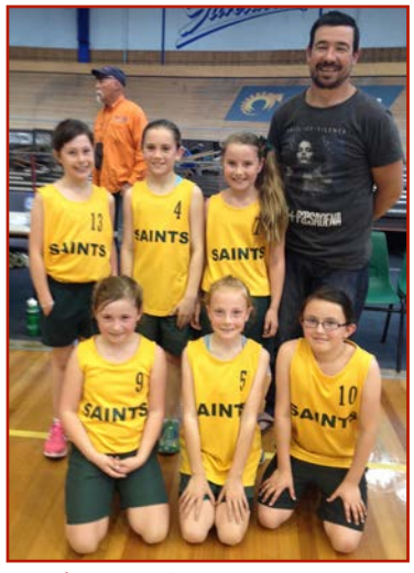
3/4 Girls B - Warren