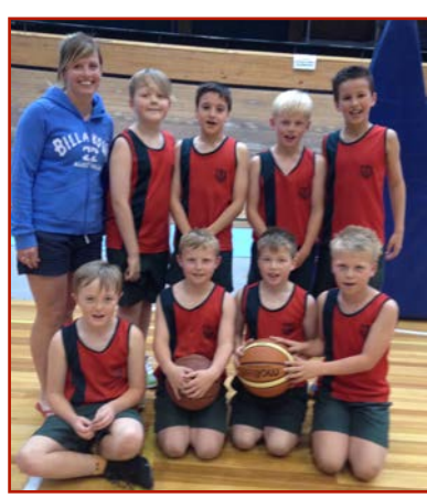
3/4 Boys B - Cowley