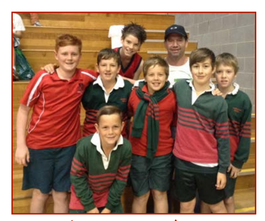
5/6 Boys B - Adams