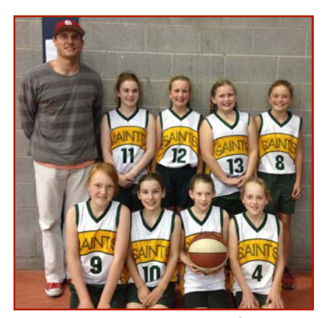
3/4 Girls A - Baldock