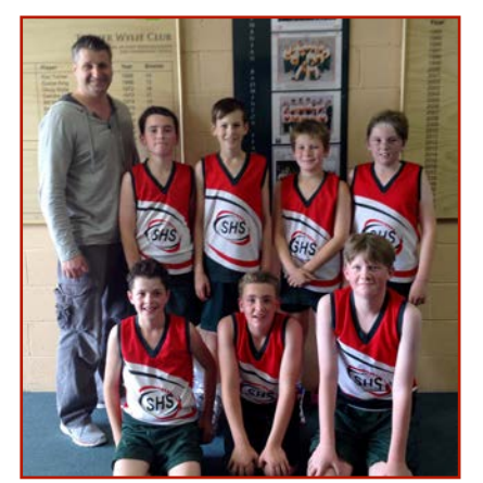
5/6 Boys B - Boric