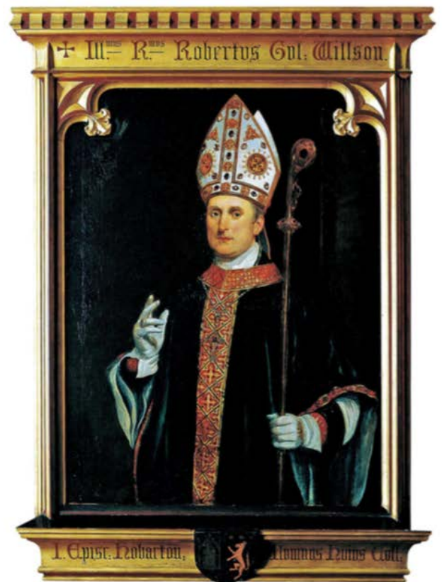
Robert William Willson (1794–1866)