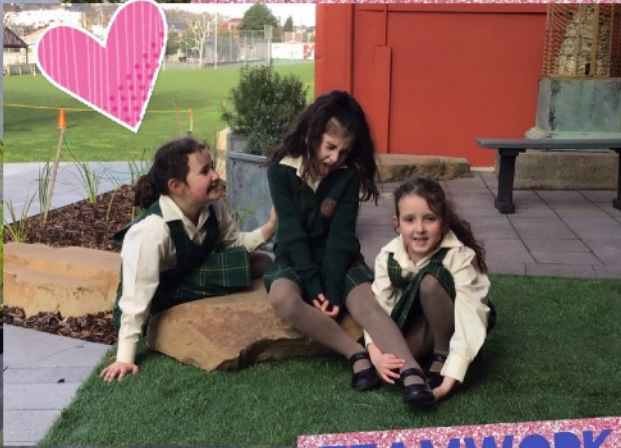
BY LILLIAN, LEXI, FREYA + VALI