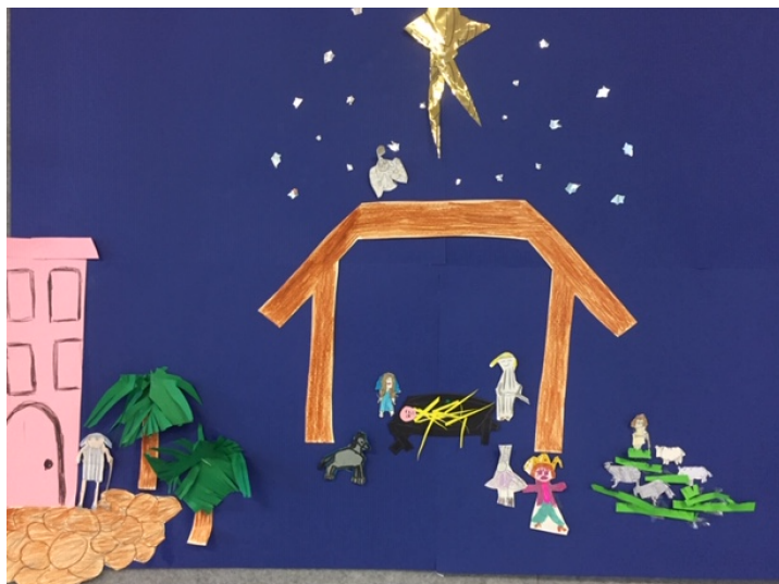
Nativity display created by Grade 1 students