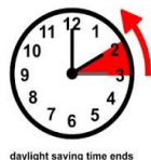
daylight saving time ends

PROJECT COMPASSION is a way to make your Lenten efforts practical in assisting those most in need. Make sure every home has one of the boxes or a set of envelopes.