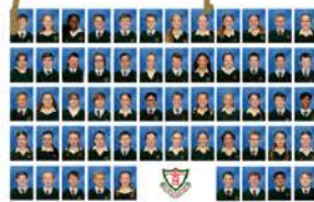
Sacred Heart Catholic Primary School