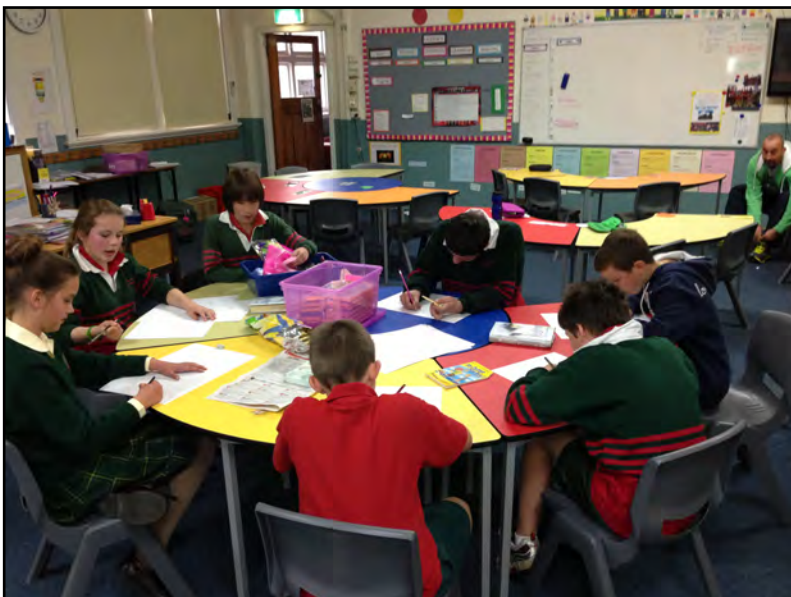
Tuesday Book Club