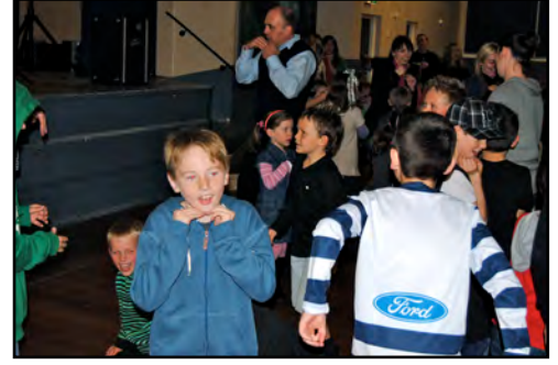
Enjoying Rock & Roll Night 2012

Encourage those interested to follow SHS School on Twitter @shslton. Regular tweets are sent out showcasing things happening in the school as well as information and reminders about events happening at school. There are currently 41 families who are following the school twitter feed.