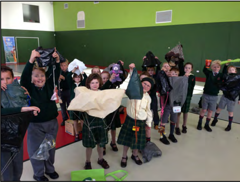
Gr 2 Parachute Experiments