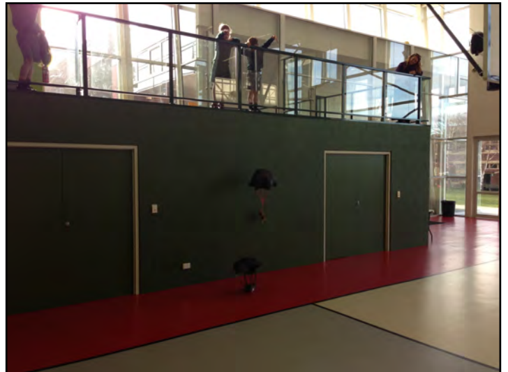
Gr 2 Parachute Experiments