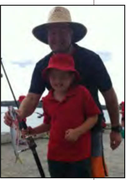
Grade 2 Fishing Excursion